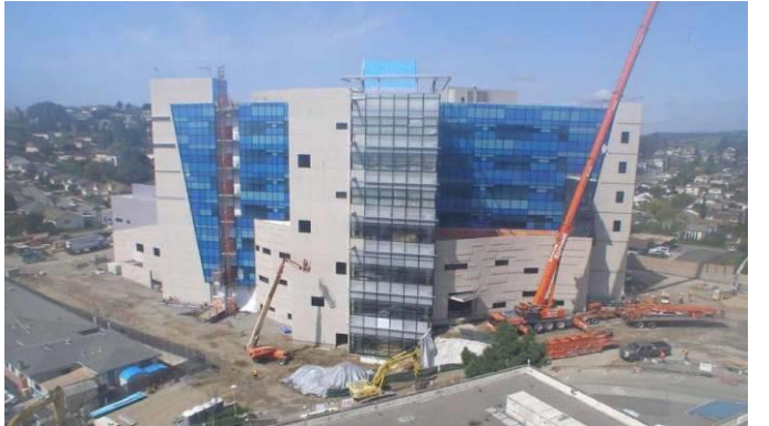
Figure 1: Webcam picture of Sutter Medical Center Castro Valley as of 17 March 2011 (http://oxblue.com/pro/open/suttermedical/castrovalley)

all actions taken on this project. Christian's (2011) "dragon of uncertainty" (Figure 2) illustrates how uncertainty can threaten schedules and control budgets.