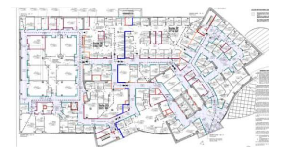
Figure 5: Colour-coded plans with simplified information and modified colour palette

After this, the final submittal was in a different colour palette and the design was split into two different plans which made the information much easier to read (Figure 6).