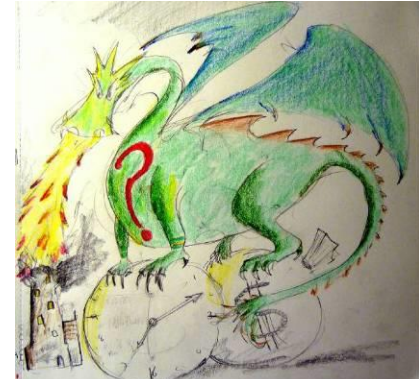
Figure 2: Dragon of Uncertainty