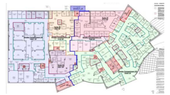
Figure 4: Colour-coded plans extracted from the BIM model, showing smoke compartments

In subsequent conversations, OSHPD reviewers commented that plans were hard to read given the colour palette chosen and contained too much information in one plan. The architects thus modified the colour palette and colour-coded plans with simplified information (Figure 5).