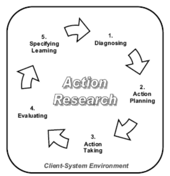
Figure 1: Action research cycle (adapted from Baskerville 1999)

Hence, this study follows a cyclic process of applied research on seven building construction sites in Sydney, Australia using the five step cycle as shown in figure 1 adapted from Baskerville (1999).