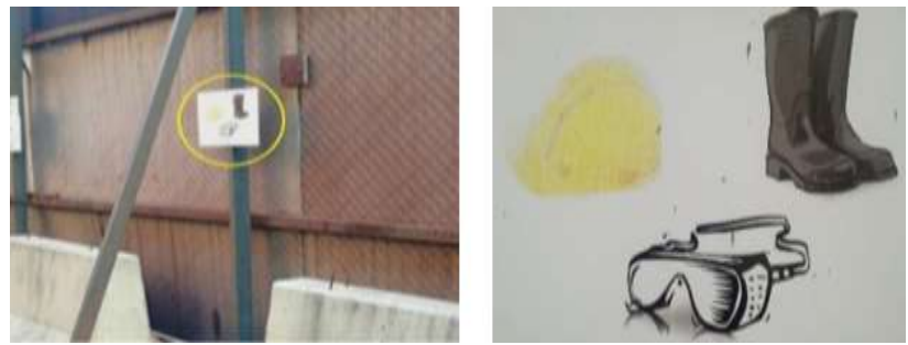
Figure 3- PPE clearly displayed

confirms the importance of having visual tools on construction sites to encourage workers to follow safety regulations and thus reduce accidents. Furthermore, both statements (5) and (6) show very low means, 2 and 2.33 respectively, and this is due to the absence of visual indicators and regulations that force, encourage, and remind the workers of the PPE whenever they are on site, whether inspecting or performing the work.