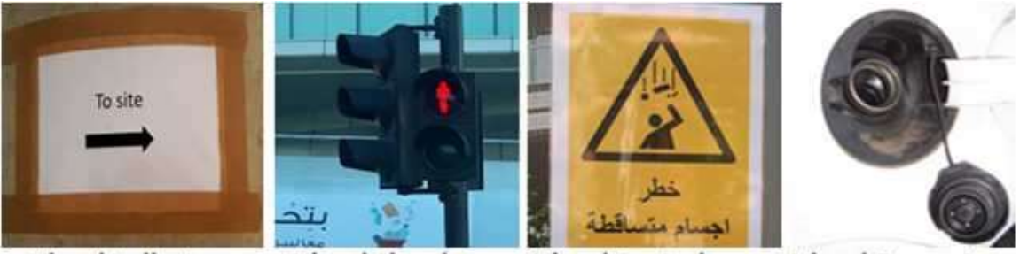
Visual IndicatorVisual SignalVisual ControlVisual GuaranteeFigure 1- The four types of Visual Tools inspired from (Tezel, 2015)

Figure 1 shows the four different types of visual tools used on different sites in Lebanon