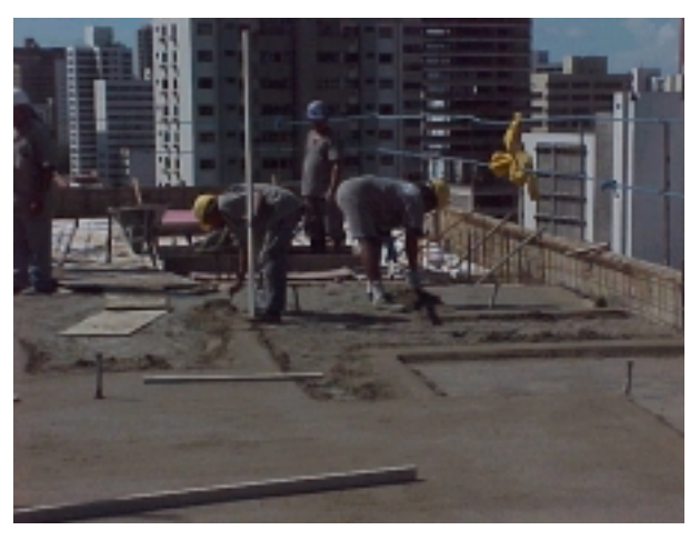
Figure 3: Floor screeding and setbacks for brick walls positioning

Operational advantages are connected to the fact that general foreman will control both operations simultaneous. Worker's water supply and sanitary facilities are placed in the vicinity and will serve both gangs of workers. Technically concrete curing will be improved by the wet, protective layer of floor screeding on its top.