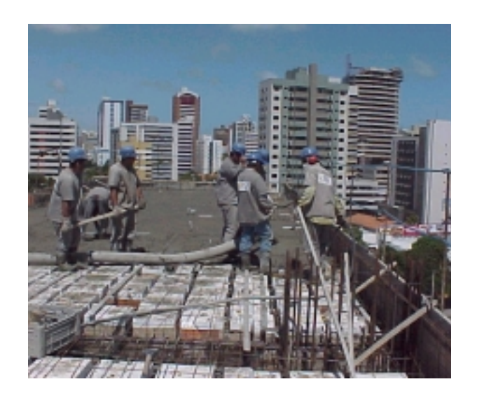
Figure 2: Concrete pouring on the top of the ceramic and polystyrene blocks

It is interesting to note that ceramic blocks are glued together with the polystyrene sheets in advance. This prefabrication is done in an open space at ground level, making it easy to control the rhythm of production.