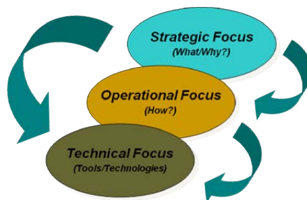
Figure 1: CPD Framework (Focus Levels)

It was also identified during the workshops that the CPD training programme should start with an introduction course focusing on the fundamentals of innovation in the construction industry.