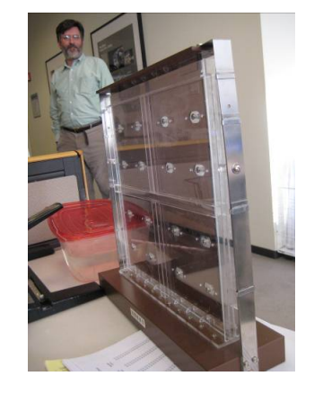
Figure 2: Viscous Damping Wall Model (Photo taken by John-Michael Wong 2/25/08).

CPMC is an affiliate of Sutter Health, a major healthcare provider in Northern California. Sutter Health has shown a commitment to lean practices in its hospital design and delivery processes (Lichtig 2005b) and is