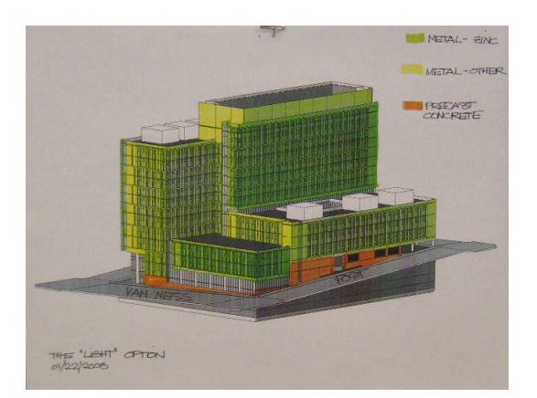
Figure 1: Schematic Building Shape and Skin.

California Medical The Pacific (CPMC) Cathedral Center's Hill project is a new 600-bed hospital in San Francisco, California, budgeted at $1.7 billion (Figure 1). The hospital is 93,000 m<sup>2</sup> (1,000,000 ft<sup>2</sup>) with 555 parking stalls with a total of 13 above and below grade stories. The project is sited on sloping terrain, 18 km (11 mi) from the nearest active earthquake fault. Design of the Cathedral Hill hospital began in 2005 and the project is expected to complete in 2013.