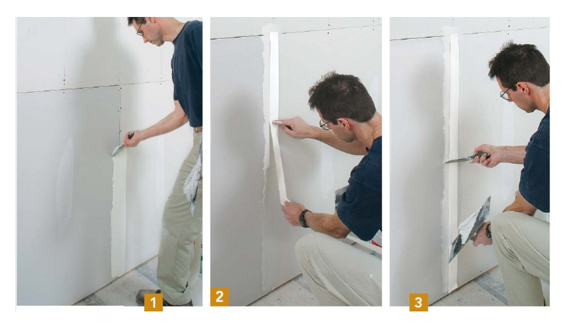
Figure 3: Plasterboard Fastening and Joint Finishing (Ferguson 2004)