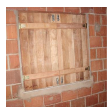
Figure 1: (a) Batten door used in PS1; (b) Window used in PS1

The wooden windows and doors supplied to PS1 were provided by a company that used to acquire materials from other suppliers and resell them to construction companies in Fortaleza. The supplier would buy the wooden elements in other regions of Brazil and transport them to a yard in Fortaleza, from there the material used to be distributed to construction projects.