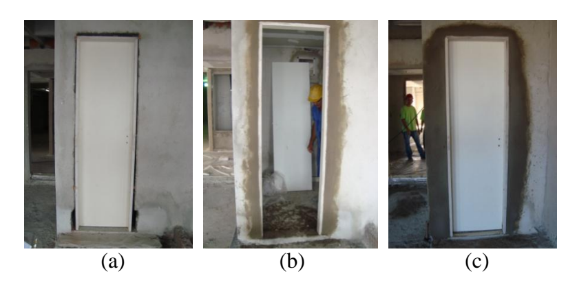
Figure 2: (a) Door frame permanently fixed; (b) Door is removed and frame remains fixed; (c) After the voids are filled with mortar the door is installed again.

During the installation phase, the supplier's workers positioned the door in the opening, made adjustments to align and level the door and permanently fixed the door to the walls (Figure 2a). After this task was completed, the general contractor's workers would remove the door from the fixed frame (!!!) and fill in the voids around the door with mortar (Figures 2b and 2c). This operation was carried out to avoid damages or spilling mortar on the door. The prefabricated door was disassembled and then reassembled again increasing the installation lead time.