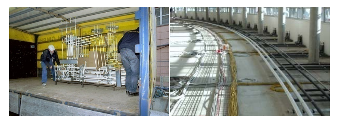
Figure 2: pre-packaged materials for MEP-system installation (left hand side); installed MEP systems (right hand side).

Application of modular design reduced building complexity greatly. The design methodology triggered beneficial discussions between designers about trade-offs between standardization and variation, which improved the building design in accordance with customer value. Also, the new design enabled the use of a different installation process of the heating system. Originally, it was planned to wield hot-water pipes in place, but standardization of structures enabled off-site pre-fabrication of pipe systems. This new production process was expected to reduce 25% of cost and 60% of scheduled time. Unfortunately, these savings in the cost and time could not be realized. The now faster installation process could not be executed in a continuous flow, but instead in a stop-and go manner, because it's speed was not aligned with the speed of the other installation processes. Figure 2 shows, left hand side, the pre-fabricated materials pipes, and right hand side, the final product in place.