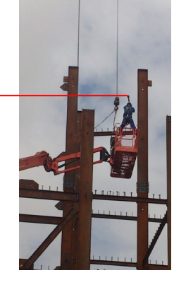
Figure 2: Example of making-do and resilience

The lanyard is anchored on the hook of the crane that is suspending the beam