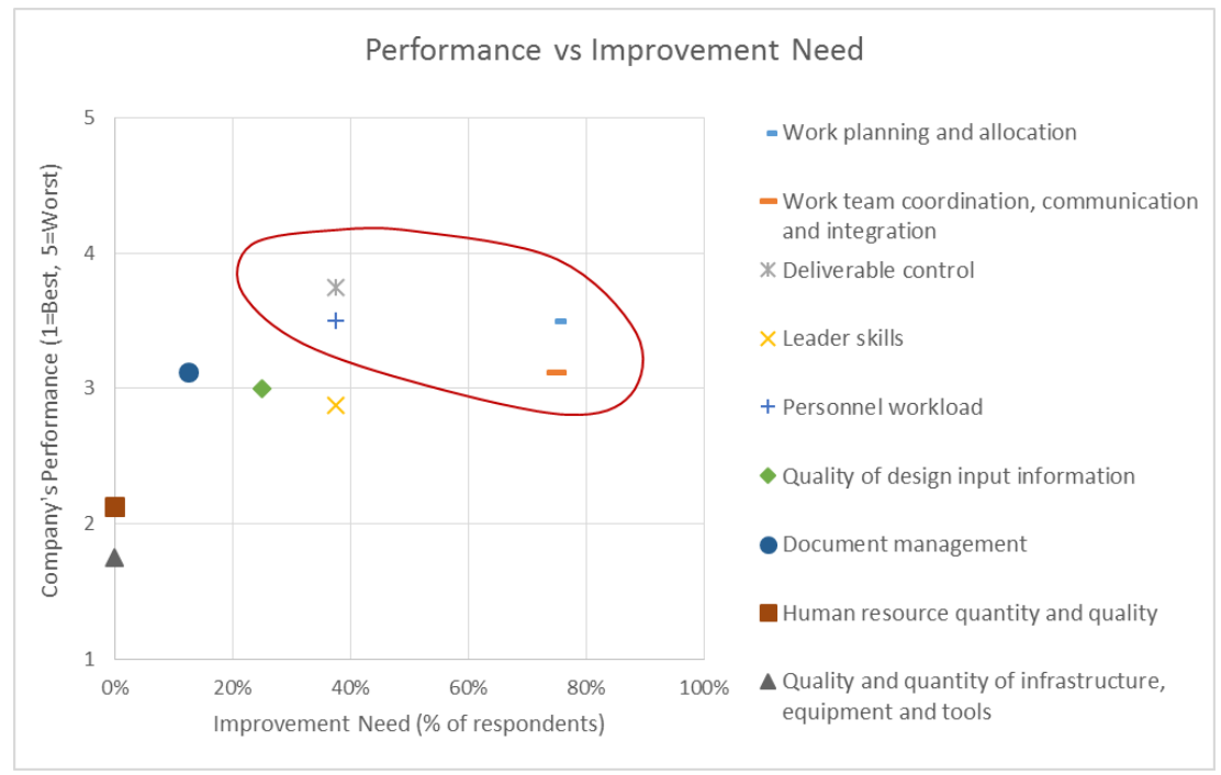
Figure 1. Company's performance and improvement need regarding the identified factors for an efficient design. Annotation highlights the most relevant factors.

Figure 1 shows that none of the design professionals consider that quantity and quality of both human resources and infrastructure, equipment and tools are part of the three most important factors that need improvement to accomplish an efficient design. At the same time, the professionals declare that the company is doing relatively well on those factors.