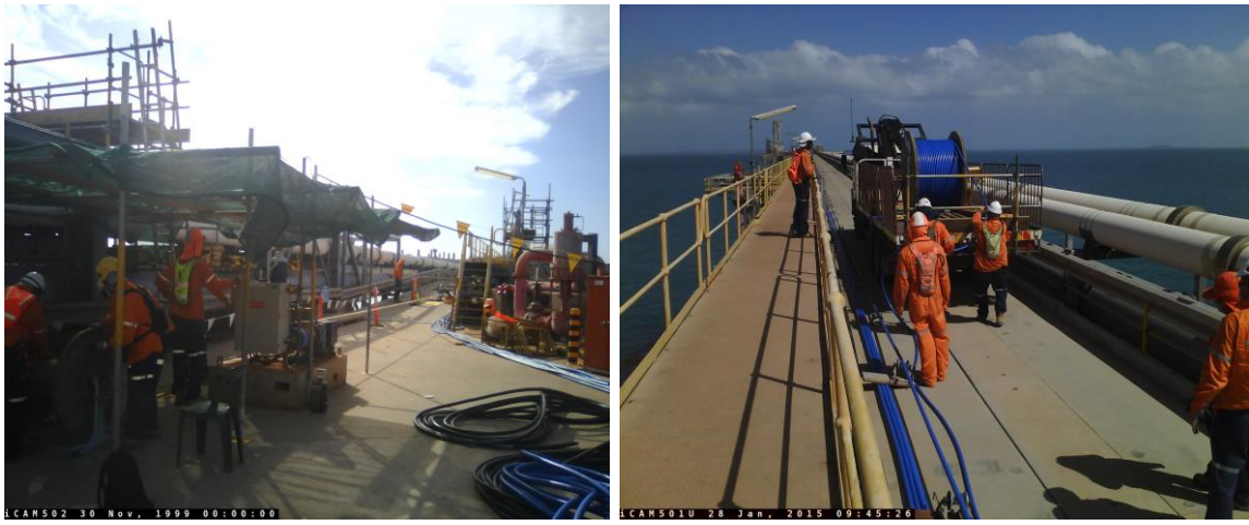
Figure 5. Use of winch

white board (figure 4). The outcome from this workshop was implemented on site in a FRS (figure 5).