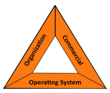
Figure 1: The Basic Elements in Projects (adapted from Thomsen, et al. 2009).

The operating system consists of the fundamental principles and methods by which the project will be managed.