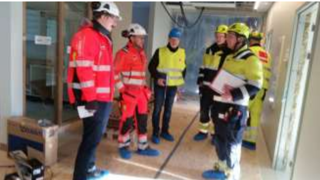
From team-leader walk case 1.

In response to this situation, the team-leader walk, or just 'walk' (in Norwegian 'Basrunde') is introduced in order to help the team-leader meeting to see and plan three weeks ahead. One aspect separating this approach to the team-leader walk from similar planning practises is its explicit relation to the TAKT organisation of the building process. With TAKT the production front and horizon three weeks ahead is structured in a specific way in terms of systematic movement in time and space through the building, divided in zones.