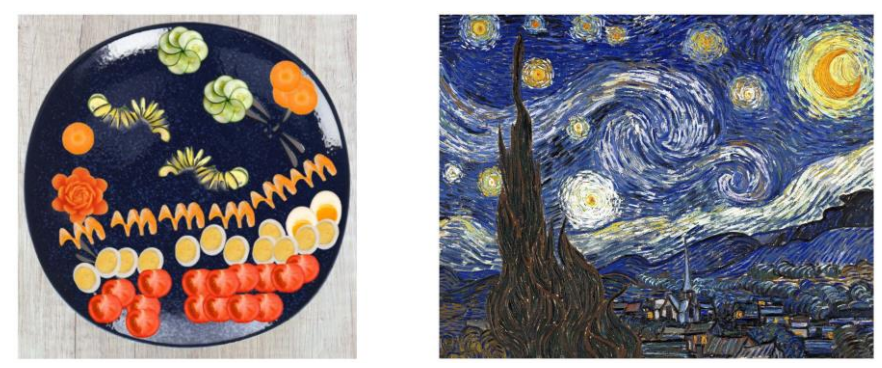
Figure 3: Design reference that mimics van Gogh's The Starry Night painting

Table 1 and Table 2 present the task details and the rundown of 15 mins duration in Round 1 and Round 2 respectively. The duration shaded in blue refers to the period when the players can actively work either on the Google Slides (as indicated with "SL") and/or on the Google Sheet (as indicated with "SH") to develop the salad design. While those shaded in green (as indicated with "View") refers to that the players can only passively observe the design processes conducted by their other teammates on both the Google Slides and the Google Sheet. The red thick vertical line indicates the design freeze cutoff time when the Artistic Chef and the Recipe Chef in each team can no longer continue their design development. In Round 1, the design process takes only 10 mins. The Executive Chef can only price the process after the design freeze; while in Round 2, the design process takes longer, with 15mins, and all players have to stop their work at the design freeze. In Round 1, the Restaurant Owner is not allowed to provide any comment throughout the design process. While in Round 2, the Restaurant Owner can provide verbal feedback during the design process. At the end of the game, the Restaurant Owner in each team has to either approve or reject the salad design based on the customer's requirements and values to the project stakeholders. The design process in Round 1 is relatively sequential while that in Round 2 adopts integrated information and organisation in the design process.