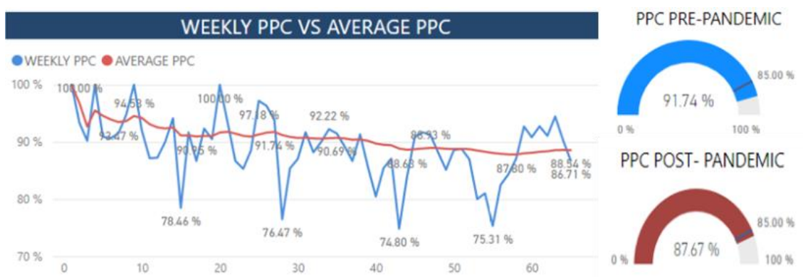
Figure 6: Plan Percent Complete in the residential studied project.