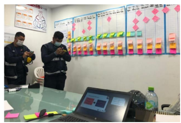
Figure 5: Pull Planning on-site with the project team

To date, the civil construction stage of the project has ended and the finishing stage of the project has been completed. The following analysis is presented using the LCP of CNC and PPC of the studied project. In the analysis presented in Figures 6 and 7, the following can be seen. The PPC during the pandemic was lower compared to the pre-pandemic PPC (4-5%). In addition, the CNC was greater in the Post-Pandemic stage compared to the previous one due to the insert of the external causes related to the COVID-19. For the Control of the PPC and the CNC was used the software POWER BI of Microsoft (Aspin 2016). Moreover, in the analysis of the results of the implementation of the COVID-19 protocols, stakeholders concluded that the implementation of lean tools such as PP and WWP served to comply with the COVID-19 protocols. Given that in these meetings served for planning and coordinate the work, solutions, provisions and regulations of all the personnel, so that everyone agrees, maintains the same rules and thus complies with the protocols correctly.