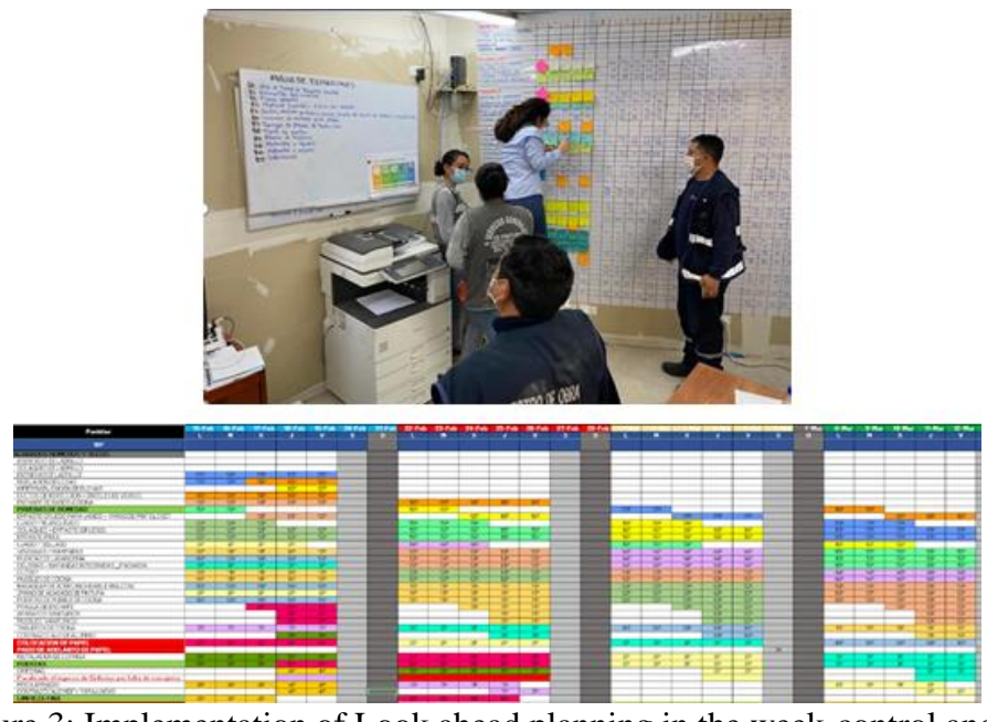
Figure 3: Implementation of Look ahead planning in the week-control and the planification of 4 weeks ahead.

On-site control of progress and personnel was done by the use of LC tools such as LAP, PP, Gemba walk, among others. In figure 3 is presented the use of LPS. Furthermore, we have seen that the implementation of LPS before and after the pandemic obtain positive results in the organization, planification and control of the project. Integrating the COVID protocols were detected new restrictions in the execution of the projects as a sanitary safety control, sectorization, efficient workspace distribution and useful work area. In addition, the planning and control tools included COVID-19 measures. For example, the meetings were held with all COVID-19 control protocols, virtual meetings with contractors were implemented to have the only and necessary direct contacts. Daily health awareness talks were held to staff and the entry of staff and contractor companies was stricter according to the new COVID-19 guidelines.