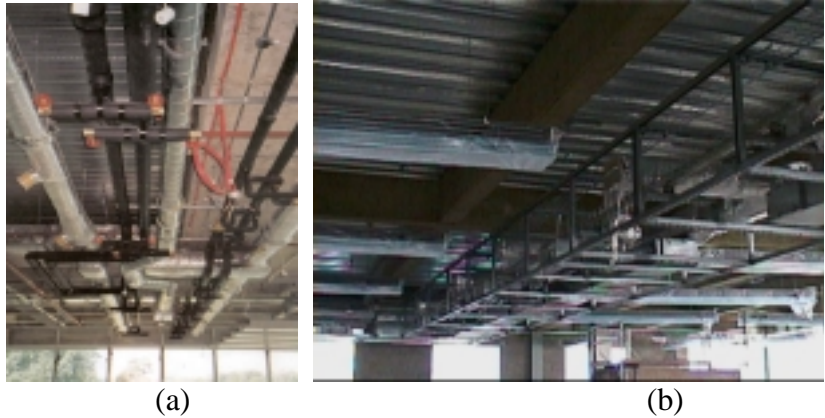
Figure 1: (a) Traditional horizontal distribution of building services (b) Installed prefabricated horizontal distribution units

Typical installations using the traditional and prefabricated approaches are shown in figure 1.