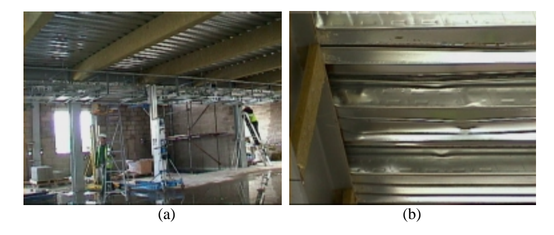
Figure 5: (a) Units being installed on site (b) damaged floor-pans causing installation problems

This example relates to the construction of an office building in a busy city centre. The building consisted of 5 storeys and a basement. The project used a traditional method of procurement where each member of the project was chosen via a tendering process. Members were appointed as and when necessary for the project with not all members of the project appointed initially.