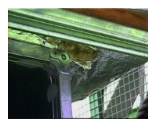
Figure 6: Damaged insulation within horizontal services distribution module

In summary, the problems encountered during installation were relatively minor and did not cause any significant delays to the installation. Almost all can be ascribed to a lack of communication and training between the parties involved. Indeed, they might be considered to be more attributable to management skills than procurement strategy, though the late involvement of building services consultants in the traditional procurement route is a likely contributory factor.