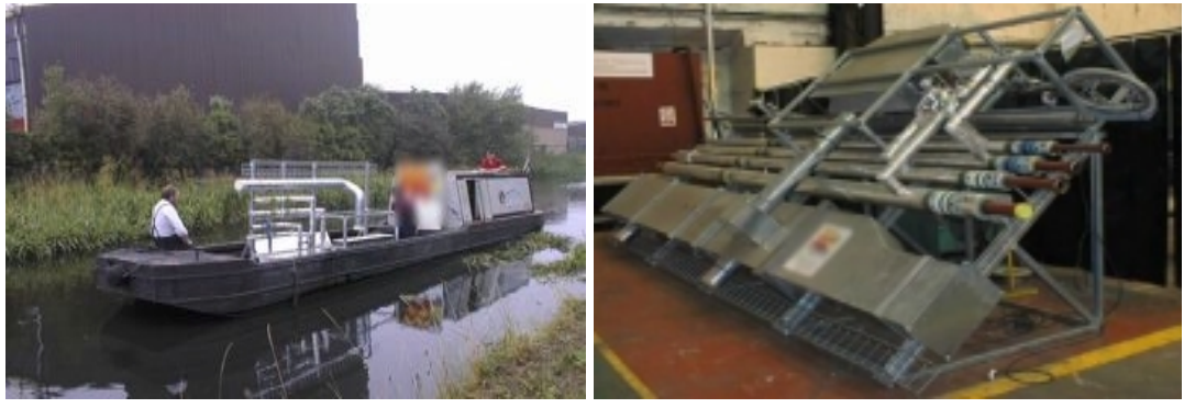
Figure 7: (a) Units being delivered to site via canal barge (b) Horizontal distribution units prior to installation

The project was to construct a new office building in a city centre location. The proposed building was an 8-storey facility. All members of project team were agreed on the potential benefits to be gained from use of off-site manufacture of building services components. Decision to investigate use of off-site manufactured services was taken early in the project's lifespan. The building services contractor, Crown House Engineering, won a specialist contractor award for the work on modular building services in this project and further details of this project can be found in the Contract Journal Awards, 2000 (Contract Journal 2000).