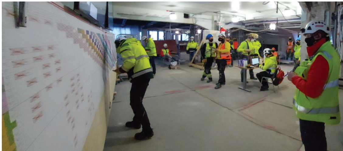
Figure 3: The progress was recorded both digitally and on a visual board in the daily huddles. The raised issues were also recorded in a digital spreadsheet.

Daily management: The PMO enforced a disciplined daily management process of takt control through worker huddles where all the trade partners were required to be represented every day. In the huddles, observed by the first two authors, the progress in the preceding two takts reported by the trade partners were recorded in a schedule printed out on a large sheet of paper for the purpose of visualization. The progress was simultaneously also recorded in the digital spreadsheet schedule. Figure 3 shows what the daily huddles looked like. Any issues raised during the huddle were also digitally recorded on a separate spreadsheet where in total over 7,000 issues were found having been recorded during the takt phase. Immediately after the huddles, the management team went to solve the surfaced issues with the trade partners. (Q1)