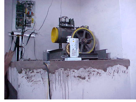
Figure 2: Rework at the engine room slab

The rework in the slab of the engine room is a common problem in elevator installation. Often the assemblers need to break the slab of the engine room during installation, due to structural design or execution errors (Figure 2).