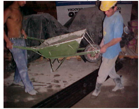
Figure 3: Stock of tracks interrupting the work flow at the site

requires the elevator installation process to be well defined, as well as its interactions with other construction processes. For example, the definition of the inventory area is important for the efficiency of the installation process, and must be established in advance because of the difficulties in transporting heavy material. Besides, the poor positioning of inventories may affect the execution of other activities on site (Figure 3).