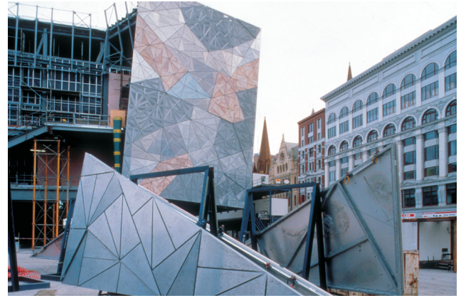
Figure 8: Apparent random fractal geometry based on a pinwheel used at Federation Square.

At Federation Square Melbourne again working with Atelier One we were struggling with translating the architects (Bates and Smart) idea for using an apparent random arrangement of stone, zinc and glass panels based on fractal geometry, we decided on a three point pinwheel to fix the panels rather like changing the wheel on a car.