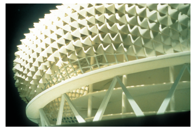
Figure 6: Early model of Singapore Arts Centre.

The Singapore Arts Centre roof was originally designed as a monolithic shell by Michael Wilford. I worked with Atelier One London to develop a dynamic form of triangular glass panels with aluminium sunshades. Here we were consultants to the client assisting the German subcontractor Mero to devise a system capable of meeting the client's requirements not only for appearance of the performance requirements for weathering and wind loading. The concept originally developed by the engineerings office Atelier One was a sculpted non-linear form of the concert hall and lyric theatres with an articulated surface using a space frame grid with glazed infill and aluminium shading devices. The modelling of surface geometry using Micro station creates a mesh of equal-length elements to standardize their manufacture.