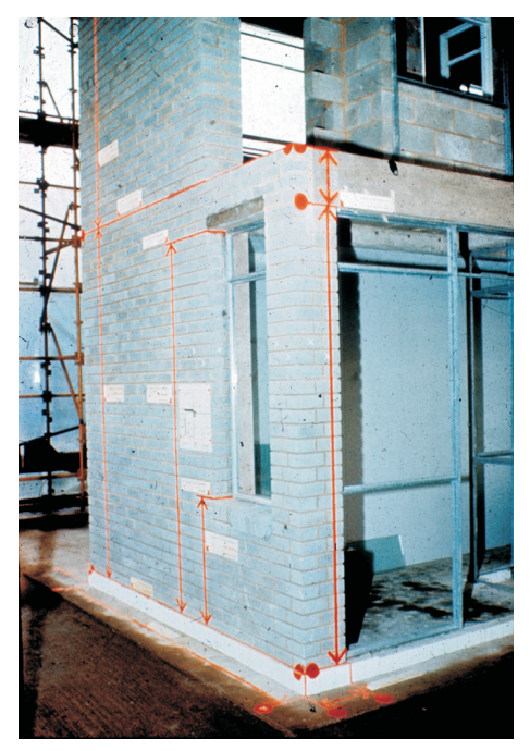
Figure 4: Dimensional control lines on the Method of Building Rig showing components within their own 'basic' space.

Department of Education & Science and the Ministry of Health.