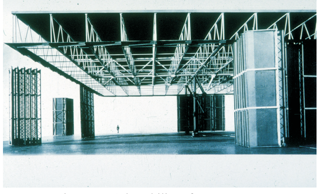
Figure.3: Adaptability of components (Konrad Wachsmann)

1961 also saw the publication in English of Konrad Wachsmann's. The Turning Point of Building which contains one of the clearest statements of the case for mass production and industrialised buildings using the ideas of modules and standardisation (Wachsmann 1961).