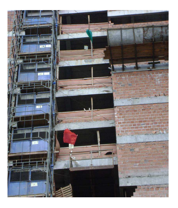
Figure 2: Use of flags for communication about materials

site, wasting time when waiting for information to arrive which also creates a dependence on the construction site managers. A good practice identified in project B was the use of flags as a way of communicating the presence of a material (green flag) or the need for more material (red flag) (see figure 2). Another good practice identified in project C was the use of a board with performance measurements related to the quality of the service which was place in the lunch room.