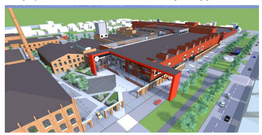
Figure 2: an illustration of the Porin Puuvilla shopping center

• Size of project: 100 000 m<sup>2</sup>, 400 000 m<sup>3</sup>, 2000 parking places